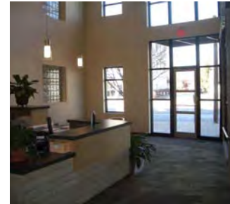
Sidewalk Accessible Lobby