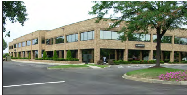
Bluegrass Parkway at Watterson Trail, near Blankenbaker Parkway