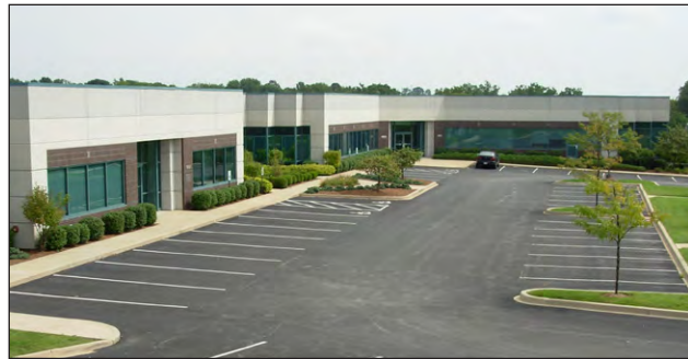
Located in Blankenbaker Crossings, next to Bluegrass Industrial Park