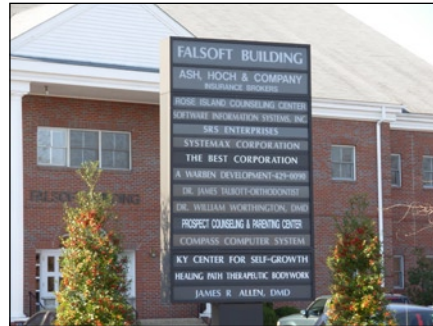
Monument signage available