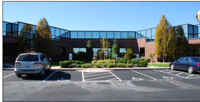
All suites have private entrances off an attractive central courtyard