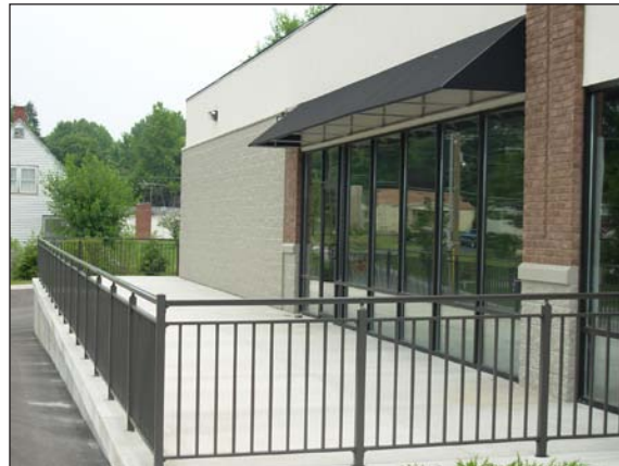
End Cap with additional 1,100 SF featuring gated terrace patio for outdoor seating